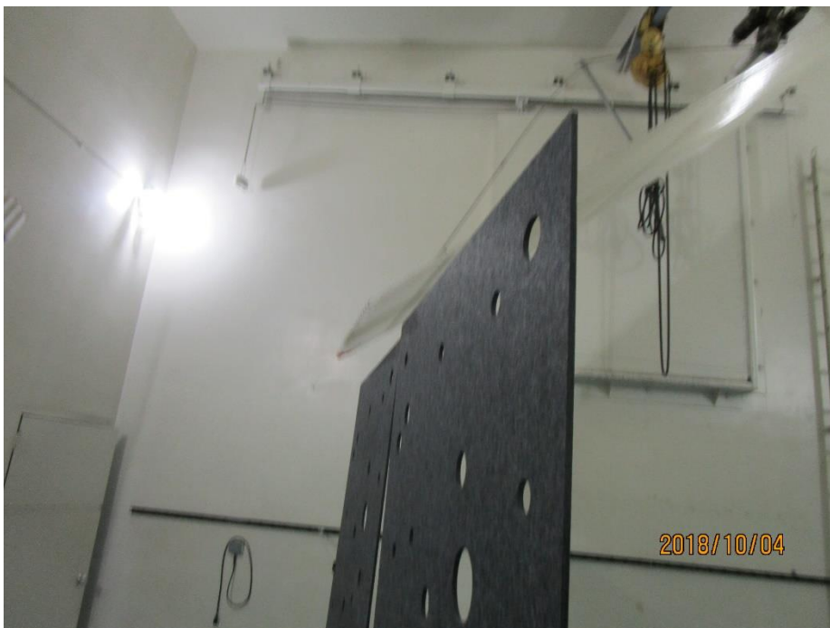
Figure 2 - Detail of the test specimen