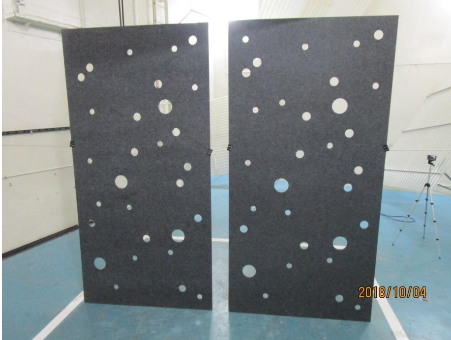
Figure 1 - Specimen mounted in test chamber