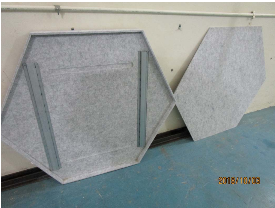
Figure 2 – Body (left) and cap (right) pieces for individual unit