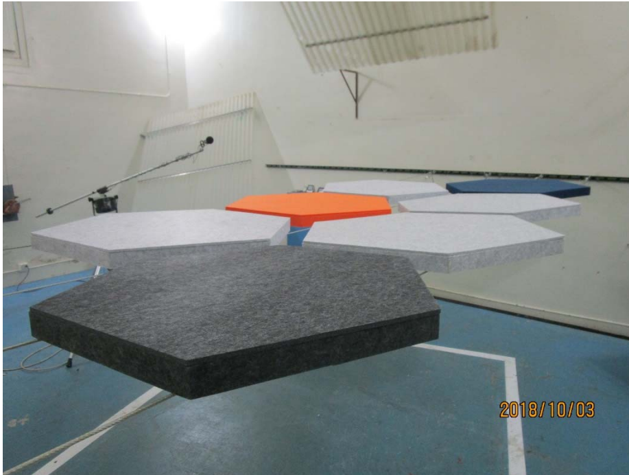
Figure 1 - Specimen mounted in test chamber