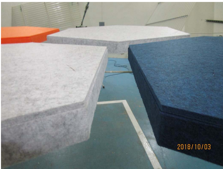
Figure 4 – Detail of specimen material, cap installation method