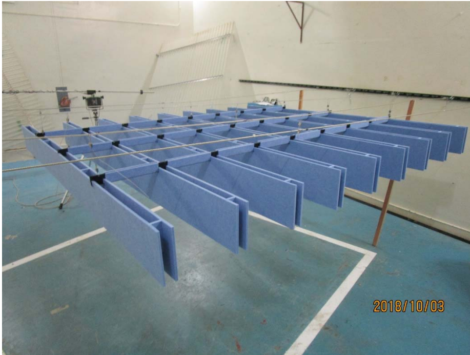
Figure 1 - Specimen mounted in test chamber