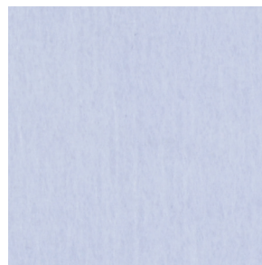
PI14 - POLAR ICE