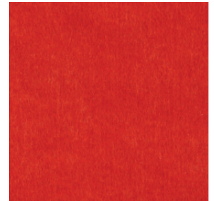
RR28 - RUBY RED