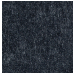
CG06 - CHARCOAL GRAY