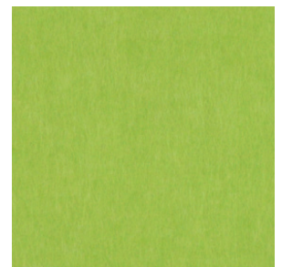
GA41 - GREEN APPLE