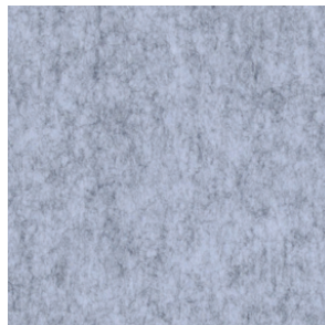
SG04 - SILVER GRAY