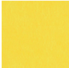
SD18 - SUNNY DAYS