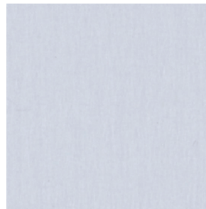
CW04 - CLASSIC WHITE