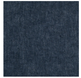
ES07 - EBONY SLATE