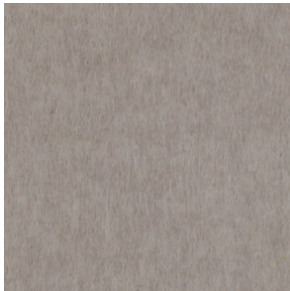
DS10 - DESERT SAND