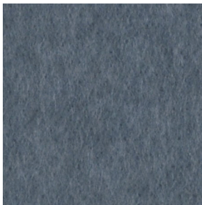
DG34 - DARK GRAY