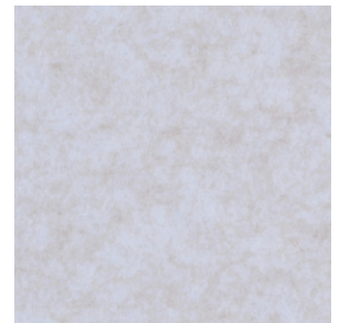
LB01 - LIGHT BEIGE