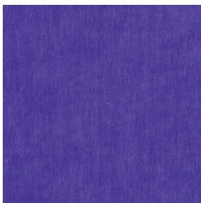
DP30 - DEEP PURPLE