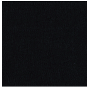
PB09 - PURE BLACK